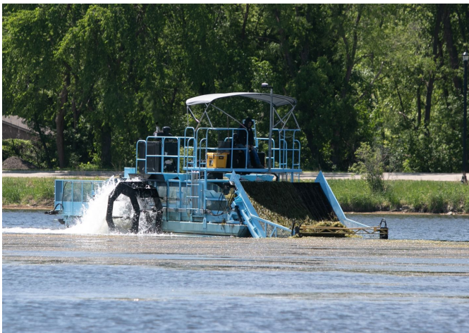
Waseca County harvesting of curly-leaf pondweed

This became a problem in 2020 as it tends to clog up water movement and recreational activities when it reaches the surface in June. The good news on this weed is that the special whole lake fluridone treatment that we did in 2022 has worked great to date and we haven't seen a EWM plant in either 2023 or 2024. We need to keep an eye on this so if anyone spots any plants with the red top at the surface, please notify the WLA so we can address it before it becomes a bigger problem as it did in 2020.