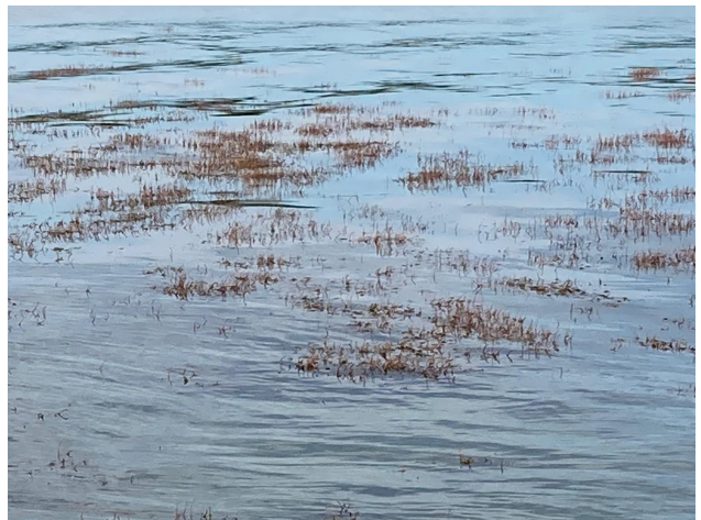
Eurasian watermilfoil in Clear Lake in August of 2020