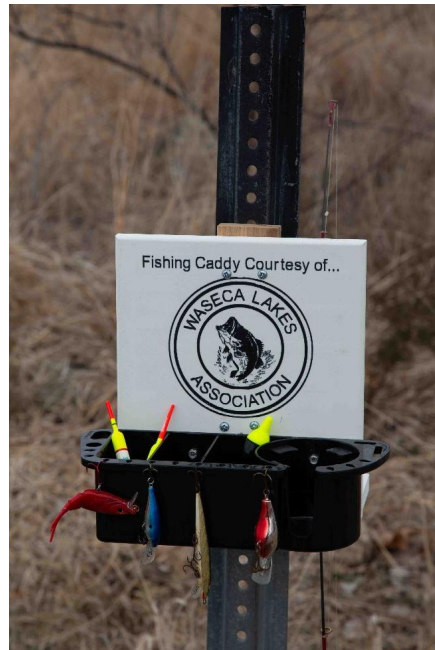
Caddy #1 at the popular fishing spot at the inlet from Gaiter Lake across from Barney's.